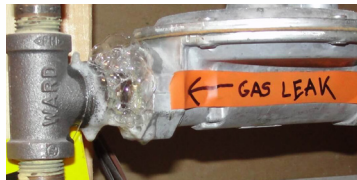
Leaking gas pipes